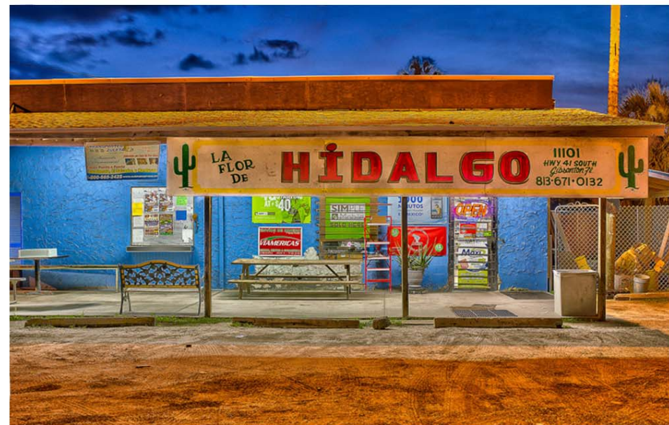
Hidalgo by Peter Bates